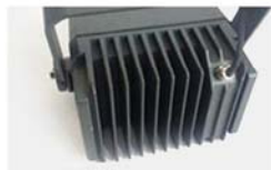
Heat sink structure