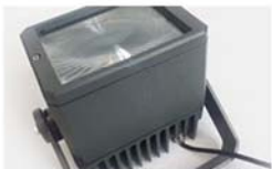
Adjustable mounting bracket