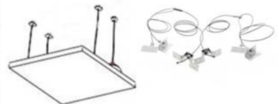
Mounting Clip for Aluminium Dampa Ceiling (Order Code: RD10)