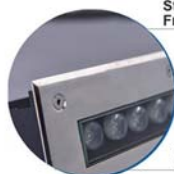
Stainless Steel Frame