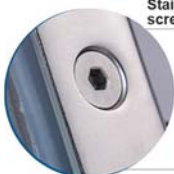
Stainless steel screw

Full copper core Easy to bend waterproof cold-resistant